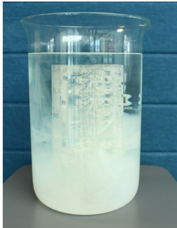
WSS™150 (water-soluble support) removal using tap water.

“Printing one of our small engine parts and using the water-soluble support has been a game changer for us.” Brian Tempest, Design Engineer – Tempest Tool & Machine, Inc. “We just left it overnight in a bucket of tap water and the part was 100% clean and clear of support. That speaks volumes for what that support material can do for us. It has completely changed what we can do as far as clean up. It’s really unbelievably simple. We’ve got a $5 bucket of tap water and it’s totally hands-off. We have not changed out the WSS support material in the J55 and are using it with all prints because it is so convenient. We have also tested the Stratasys L2S™ liquid to solid powder with a 10 gallon barrel and can report great success. It’s very simple to use and a great option.” Tempest can now stay ahead of the competition and continue providing their customers with high-quality products.