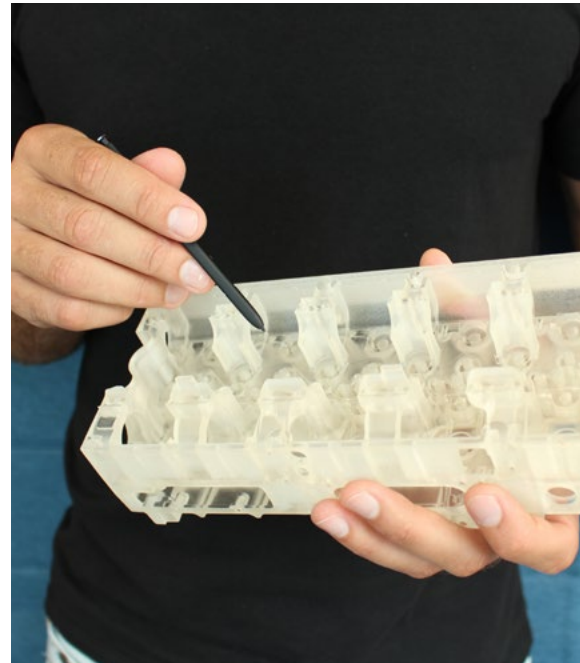
3D Printed small-scale engine component used for training.

One of the many parts Tempest produces is a small-scale engine component that is 3D printed in a transparent material. These parts, that are copies of larger, real life components, are often 3D printed as retirement gifts, but they are also used as a training tool. They are color-coded to help operators learn the various checks that must be made at different stages of the manufacturing process. Once they have mastered the assembly process, they will be able to work on the real engine components with confidence. These training tools are essential; however, Tempest have never before managed to completely remove all of the support material from the internal cavities of these parts. These diesel engine cylinder heads are full of cavities and long channels that hold support in places that simply cannot be reached, even with water-jet.