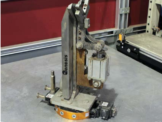
End effectors traditionally machined from metal were large, bulky and heavy.