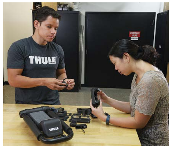
Thule engineers use FDM Nylon 12CF (carbon fiber) material to create functional prototypes.

Nylon 12CF has performed so well for Thule that the company has begun printing assembly fixtures and manufacturing aids for their Connecticut manufacturing plant. This has also saved them time and money in comparison to outsourcing. Wanting to capitalize on the benefits of 3D printing, Thule sought quotes to have large production fixtures 3D printed out-of-house. But the cost averaged about $18 per cubic inch of material, versus just over $4 per cubic inch if