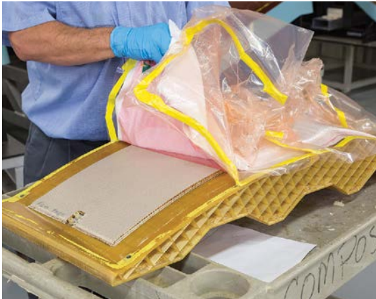
Unbagging the composite lay-up on the ULTEM 1010 tool.