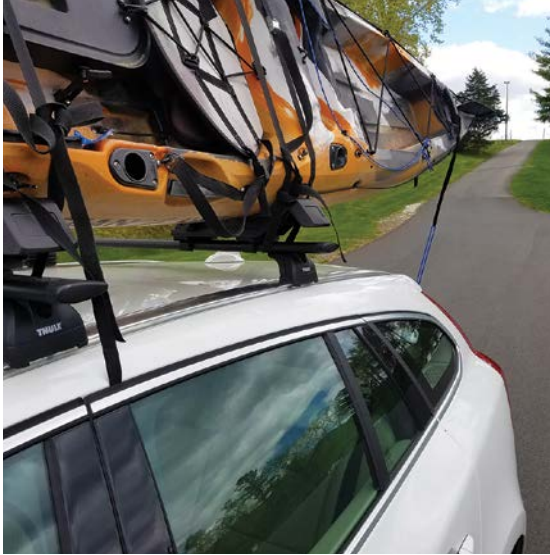
This kayak rack is typical of Thule products.

each other would break with other materials. But with the carbon fiber nylon 12 material, that's no longer a problem. Ultimately it gives Thule the ability to accelerate their product development process, since they can create prototypes, functionally test them and quickly re-print and re-test as needed to optimize the design. According to Thule prototyping engineer, Rob Humphries, "every time we print a part