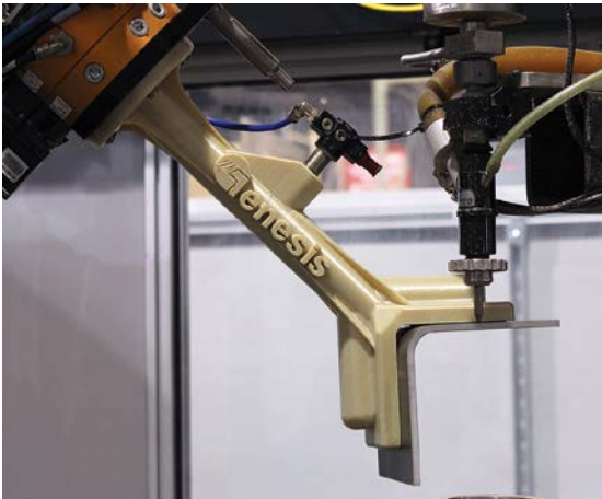
The ULTEM 9085 gripper resulted in a much lighter tool that was much faster to produce.

“Normally, it would take weeks to get traditional grippers made. With the FDM gripper, you can have a new end effector complete and bolted up to the robot within a day or so.”