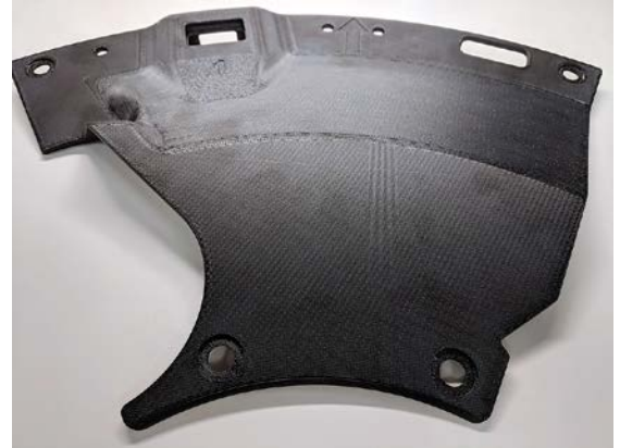
One of the Orion hatch segments 3D printed with Antero (ESD) PEKK material.

The Orion spacecraft hatch covers are made entirely from Antero (ESD), allowing Lockheed Martin to save by avoiding secondary operations to achieve the necessary ESD characteristic. Other materials would require additional coatings or plating to deflect static charge, which made Antero (ESD) very attractive to Lockheed Martin.