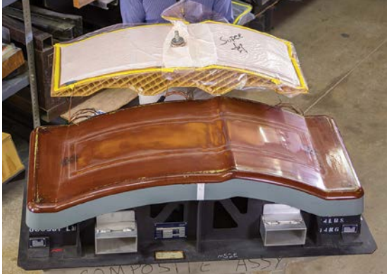
The lighter, FDM tool is shown in the upper portion of the photo compared with the typical FRP tool shown below.