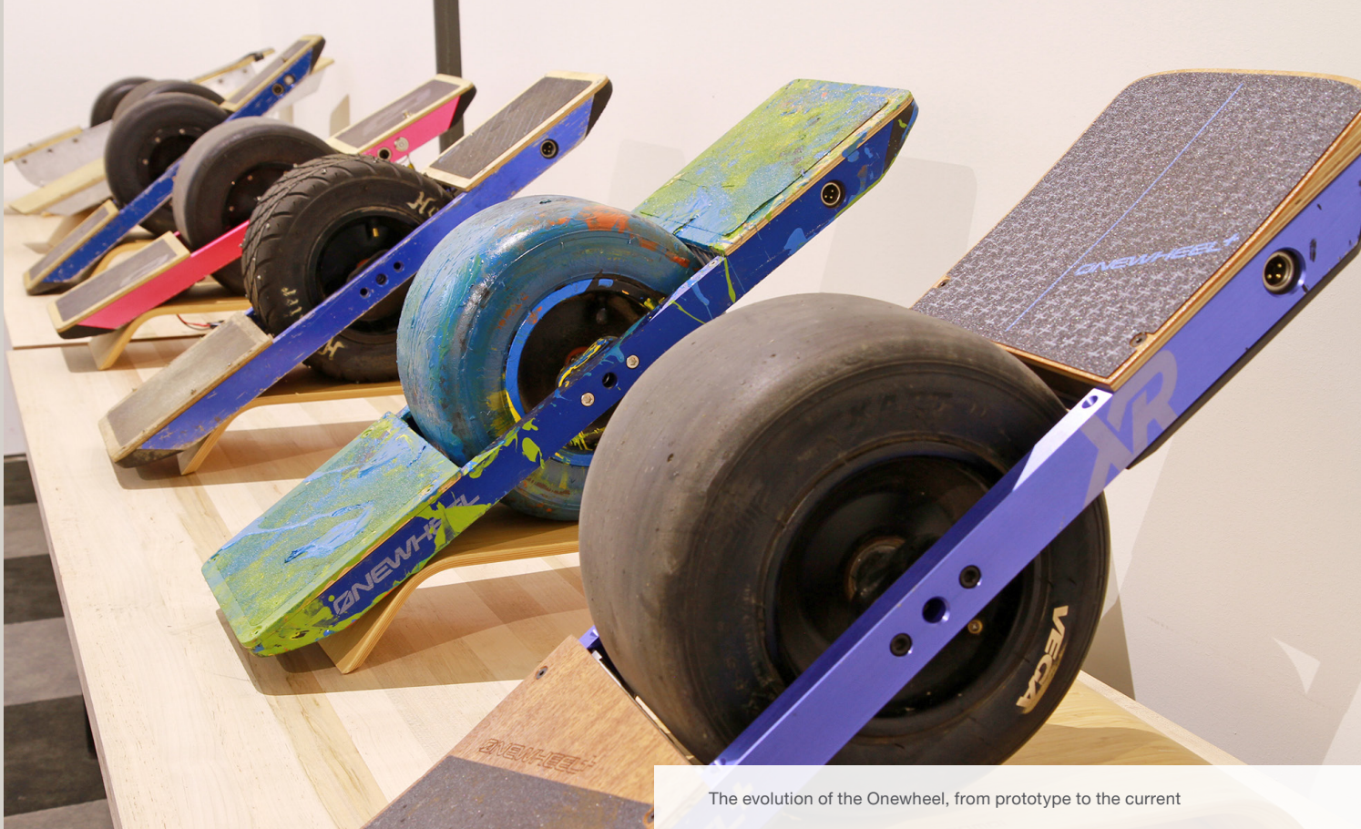
The evolution of the Onewheel, from prototype to the current