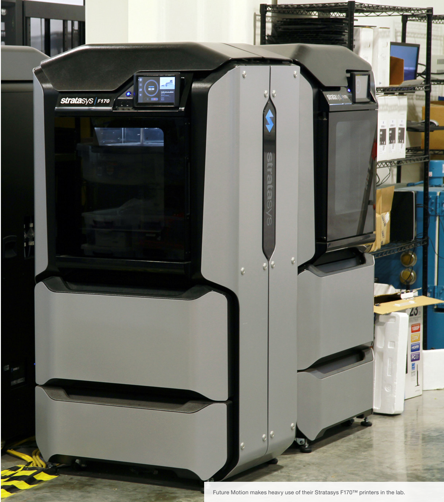
Future Motion makes heavy use of their Stratasys F170™ printers in the lab.