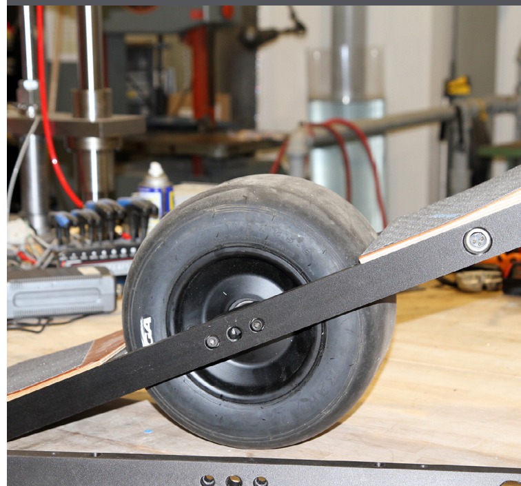
A OneWheel board with carbon fiber nylon (FDM Nylon 12CF) side rails.