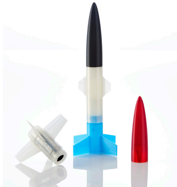
This rocket was designed following the Stratasys Rocket Learning Module and 3D printed in PLA on a Stratasys F370, a project that helps improve student proficiency in part modeling, drawing theory and assembly modeling.