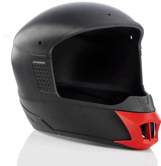
This motorcross helmet and the attached accessories were prototyped and 3D printed on the Stratasys F370.

PLA is an economical choice, providing the best option when you need fast model creation and/or need to print them in greater quantity. ASA, ABS and PC-ABS are engineering-grade thermoplastics that offer flexibility when models and prototypes need differentiation, such as UV light resistance or high strength and durability. These materials can also be printed in Fast-Draft mode.