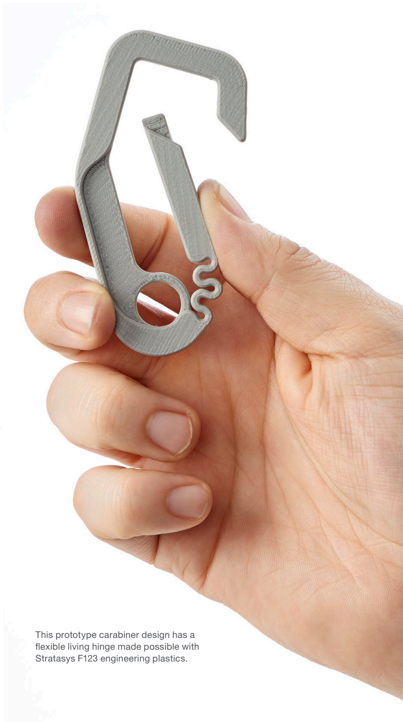
This prototype carabiner design has a flexible living hinge made possible with Stratasys F123 engineering plastics.

In contrast, professional 3D printers provide additional value that justifies the investment, through increased capability, efficiency and reliability. Don't overlook the impact in time and cost to troubleshoot the inevitable problems that occur with maker-style hobby printers.