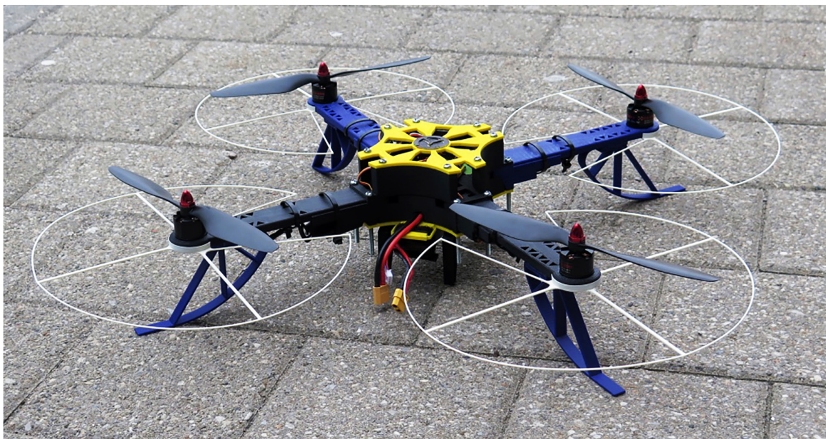
This 3D printed drone quadcopter is the result of a design challenge given to students at the John Paul II Catholic Secondary School in London, Ontario, Canada.