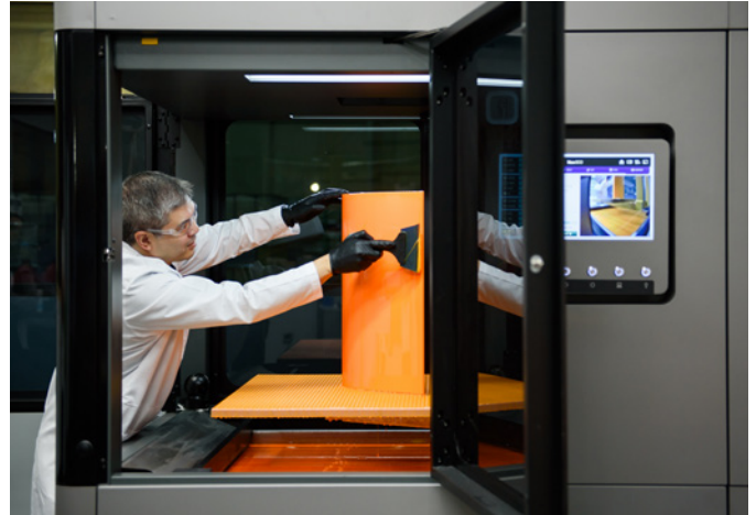
The Neo 800 is big enough to print the large airfoil models Gulf Wind Technology needs for wind tunnel testing.