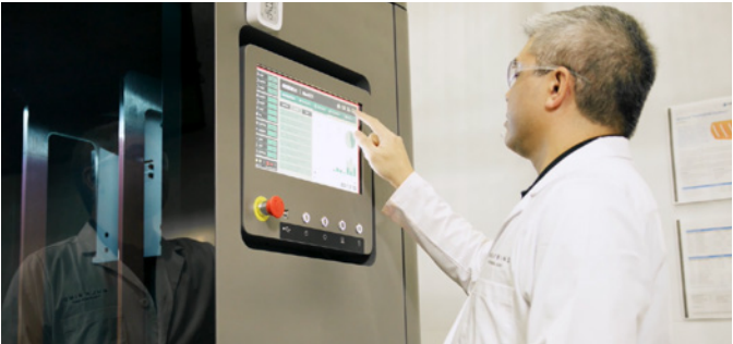
The Neo800 offers the large build chamber Gulf Wind Technology needs to print the wind tunnel airfoil models.

“It came down to the size of the parts we need to make and the material strength properties,” Lotuaco notes. “We gave our chief engineer the data sheets for all the available materials and he analyzed which materials would be capable. The Somos® PerFORM Reflect™ material was the only one that met the loads we were expecting,” says Lotuaco.