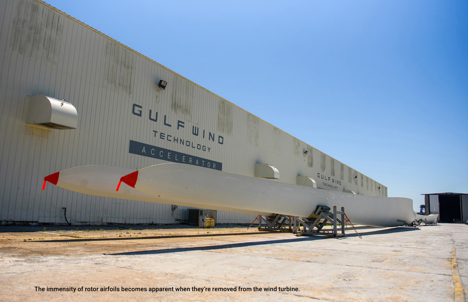
The immensity of rotor airfoils becomes apparent when they're removed from the wind turbine.

The process sounds straightforward enough, but it also poses another challenge: pushing the limits of airfoil design within the company's tight development schedule. Making wind tunnel models with traditional manufacturing is not a fast process and hinders the ability to iterate designs rapidly. When the objective is to optimize rotor design as quickly as possible, machining or molding wind tunnel models is not the answer because the time between the proposal and test of a new airfoil can be months. "That was the main reason why we wanted to have our own in-house, hurricane-capable wind tunnel, and why we want to manufacture our own test articles in-house," says Lotuaco. So for Gulf Wind Technology, making wind tunnel models with additive manufacturing provides the right approach.